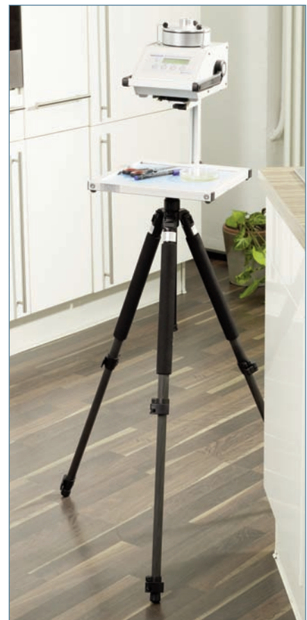
Take professional sampling with MBASS30 The picture shows optional accessories

Robust - Anodised extruded aluminum sheath - 24 month warranty (battery 12 month)